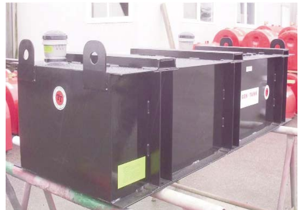
Compatible with a wide range of fuels and chemicals, including conventional diesel and biodiesel