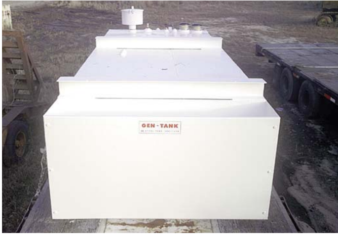
Low profile design enables structural support for the generator mounting

GEN-TANK Generator Base Tank provides sturdy support for your backup or emergency power generator. The low profile of the GEN-TANK design serves as the structural support for the generator mounting, while providing storage for a complete supply of generator diesel fuel.